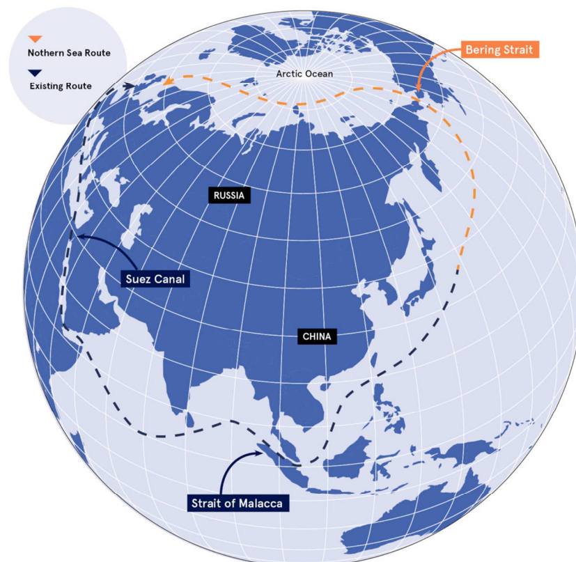
Figure 2. Representation of Northern Sea Route.